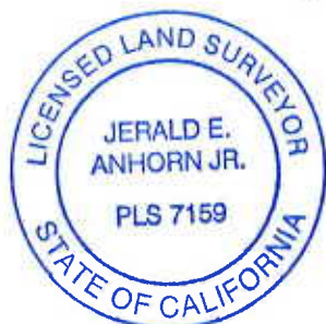
EXHIBIT "B" ATTACHED HERETO AND BY THIS REFERENCE MADE A PART HEREOF.

THIS DESCRIPTION WAS PREPARED BY ME OR UNDER MY DIRECTION: